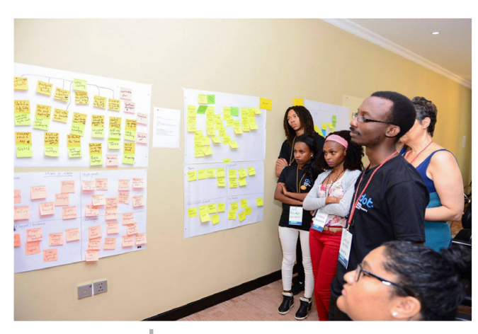
User experience workshops for Innojo involved testing paper-based prototypes and interactive scripts.

This research led to DOT engaging a human-centered design agency to dig deeper into the specific needs of young social entrepreneurs and how DOT could best serve them with a digital tool. The agency tested the viability of a number of ideas that had emerged in the research phase, working with 65 young innovators and business leaders in Jordan, Tanzania, and Ghana.