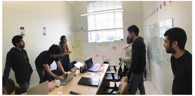
Innojo youth development team in their agile development daily scrum.

The earliest stage of research into the technology needs of young social entrepreneurs was driven by youth-led research, where youth