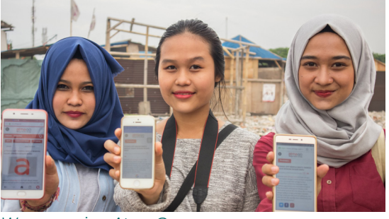
Women using AtmaGo

Atma Connect was able to quickly transition from the design and development phase to the implementation stage. Their standard process involves a project manager and UI/UX staff member working directly together to specify what the app features should look like, create it, and test.