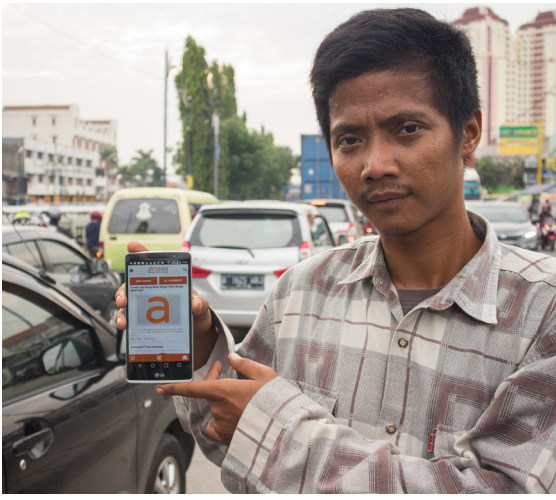
Man using AtmaGo

Once on the platform, participants immediately see a feed of content from their local area and are encouraged to register to make a post and to follow a neighborhood. Atma Connect maintains contact which allows their site to send push notifications to users to inform them about new events, resources, and popular posts in their local area.